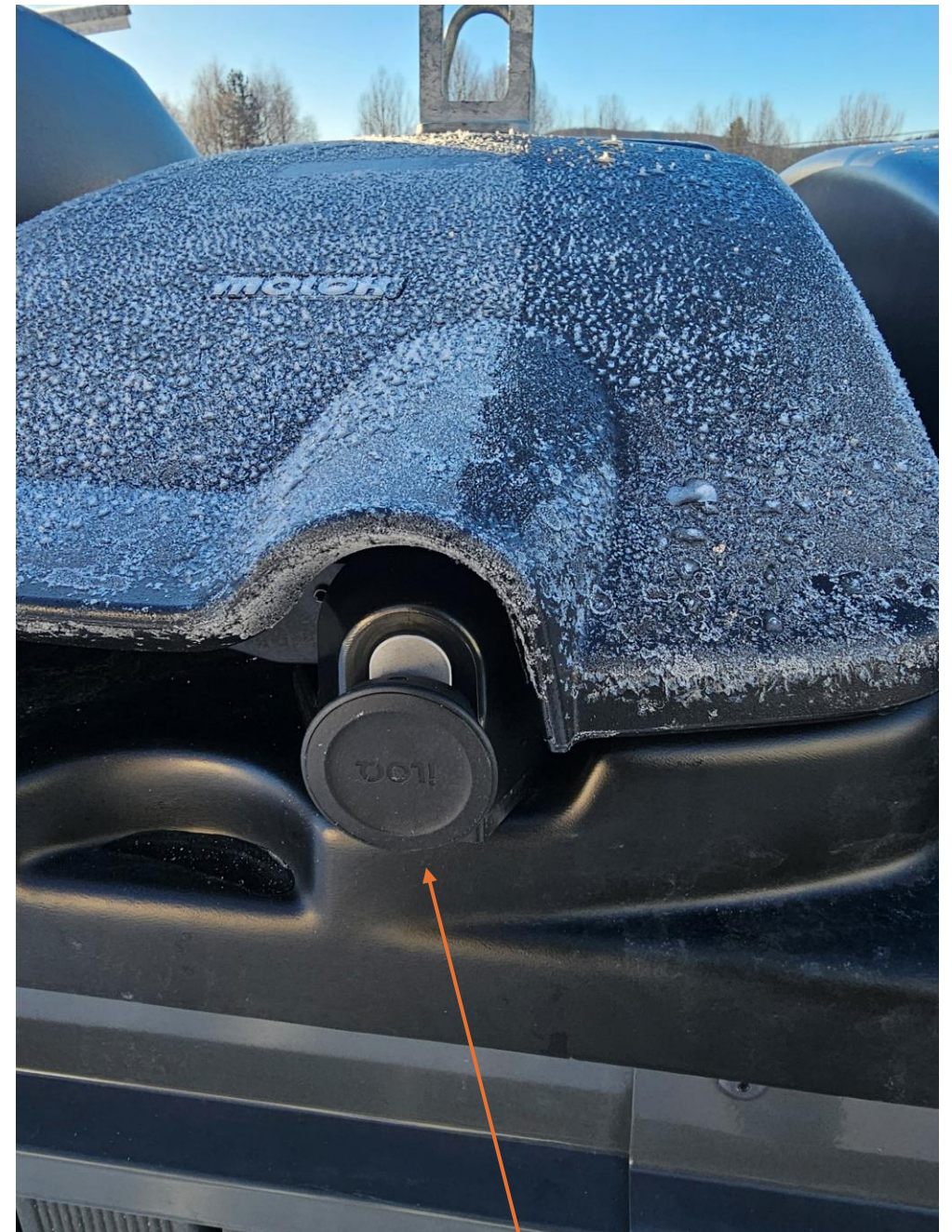
The lock on the containers