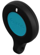
FOB without button